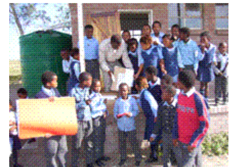
The boxes being received by the teachers and pupils.

These items will make teaching and the learning environment better for both teachers and pupils.